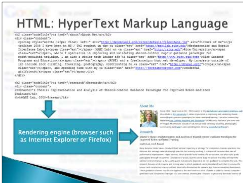
Shows markup unrendered and rendered